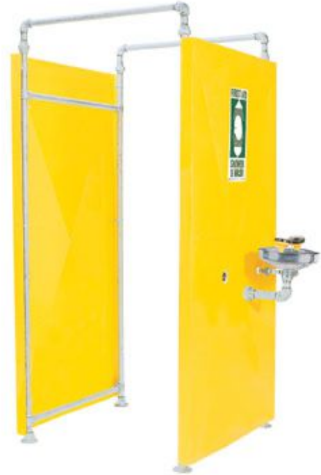
WALK-THROUGH SHOWER STATION SHOWN